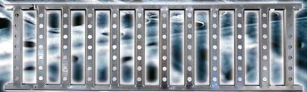
PARTHENON® Support Profile