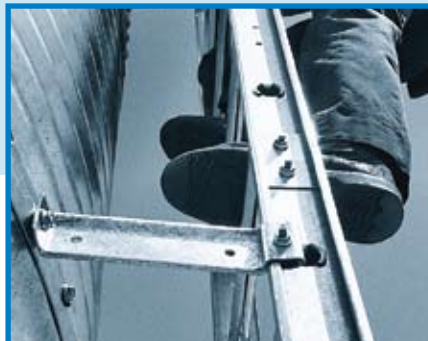
Side ladders allow plenty of space between rungs and bin wall for a secure footing.