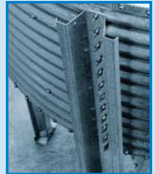
Bin legs are formed from all-galvanized steel for superior fit, durability, and strength.